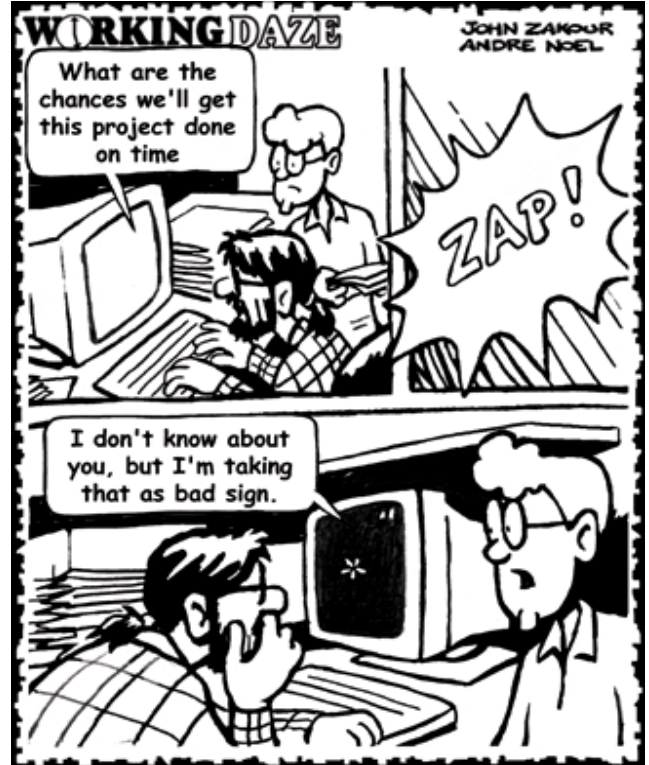
DILBERT reprinted by permission of United Feature Syndicate, Inc.